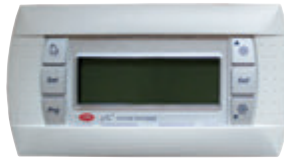
CAREL CHILLER CONTROL