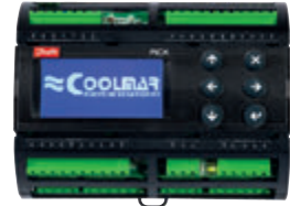
DANFOSS CHILLER CONTROL